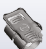
• Wearable Holder